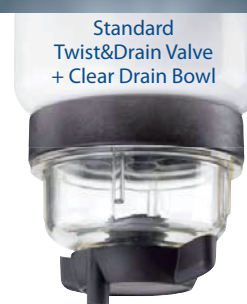
Standard Twist&Drain Valve + Clear Drain Bowl