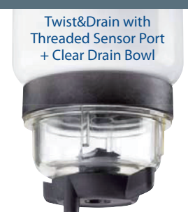
Twist&Drain with Threaded Sensor Port + Clear Drain Bowl