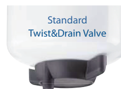
Standard Twist&Drain Valve

Donaldson fuel filter water separators are available with multiple drain options