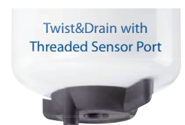
Twist&Drain with Threaded Sensor Port