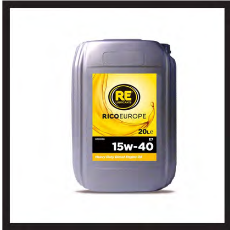
15W40 Engine Oil