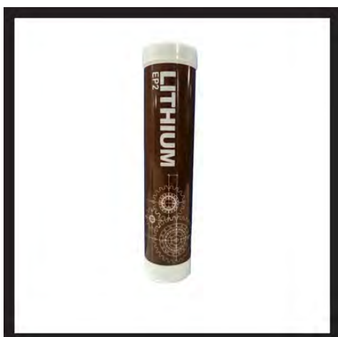
EP 2 Grease