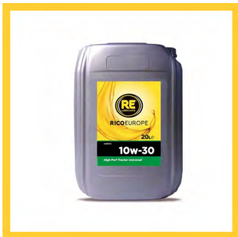
10W30 Tractor Oil