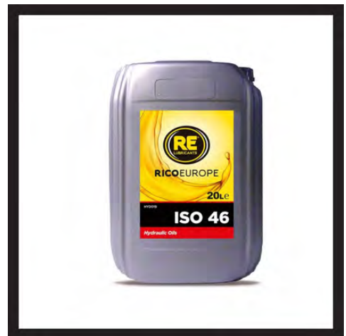
ISO 46 Oil