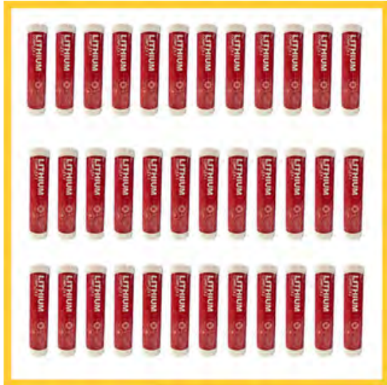
RED LITHIUM COMPLEX EP2

Our 400g grease x36 cartridges are Now Available and in Stock.