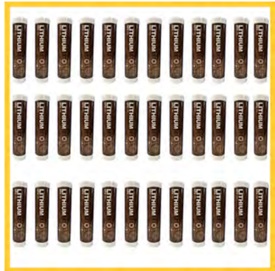
LITHIUM EP2 GREASE